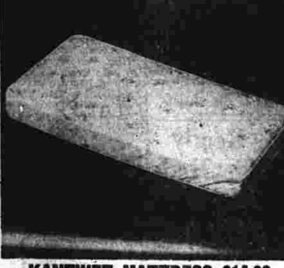
KANTWET MATTRESS $14.98