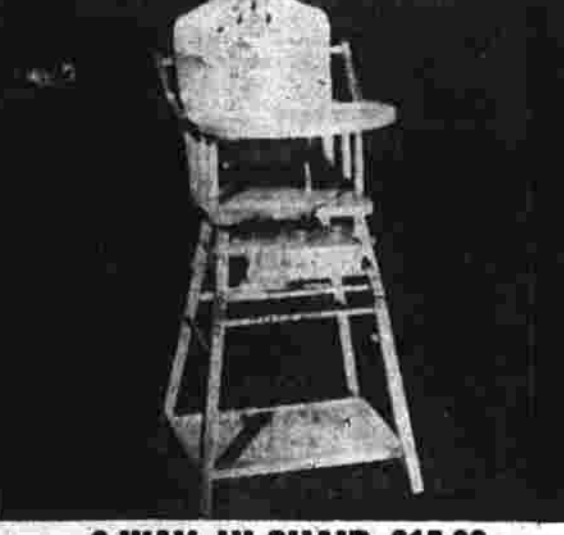
2-WAY HI-CHAIR $15.98